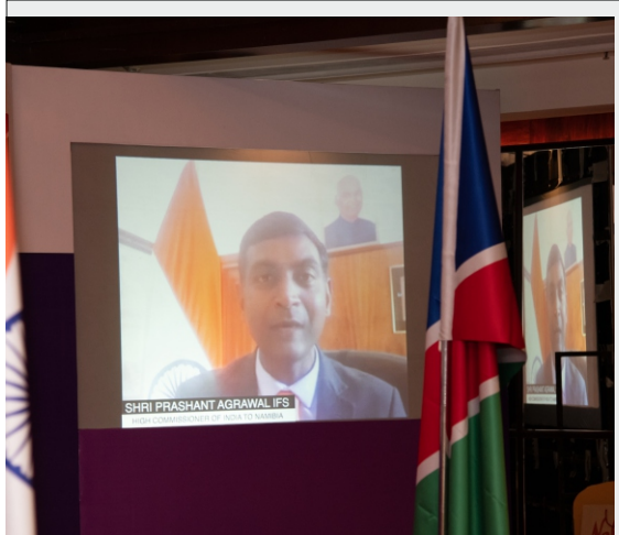
Special Address was given by the High Commissioner of India His Excellency Prashant Agrawal IFS explaining the various initiatives between the two countries especially during the COVID times.